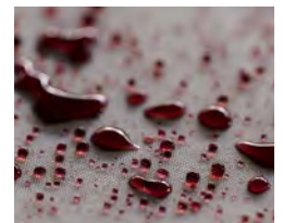
Weather & Stain Resistant Fabric